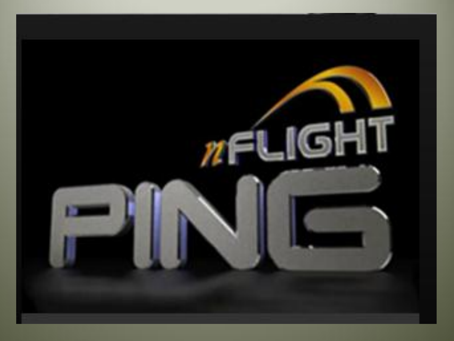
AESA Member Annual Report 2012